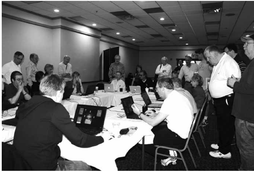
Players and kibitzers at the Bridge Big demonstration on Friday at the Galt House Hotel.

The founders of Bridge Big have some big dreams, the most ambitious of which is to organize Internet bridge tournaments for serious-money cash prizes.