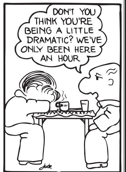
Cartoons from GO AHEAD! LAUGH by Jude Goodwin. Published by Master Point Press and available at the book tables.

yourself or out loud, “You are the smartest and best player in the room, and I’m very lucky that you are willing to play with me.”