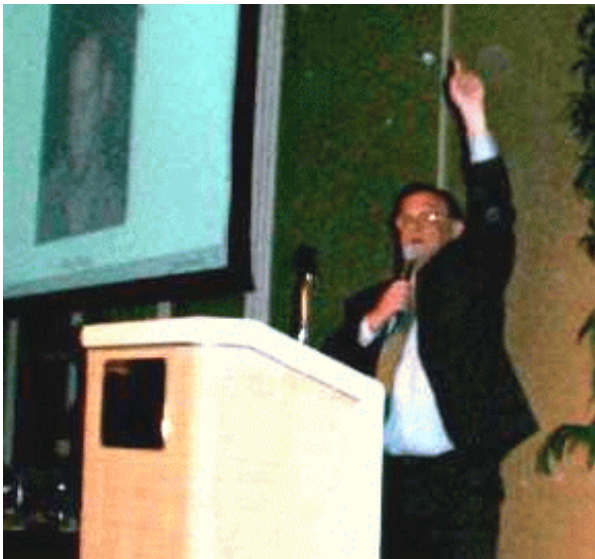
"...and if you appoint me emperor, I promise..."