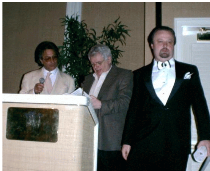
"I can't take any more of this, guys. I'm outta here."