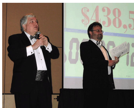
"Next we will sing Nearer My God To Thee . Please turn to page 23 in your hymn books."