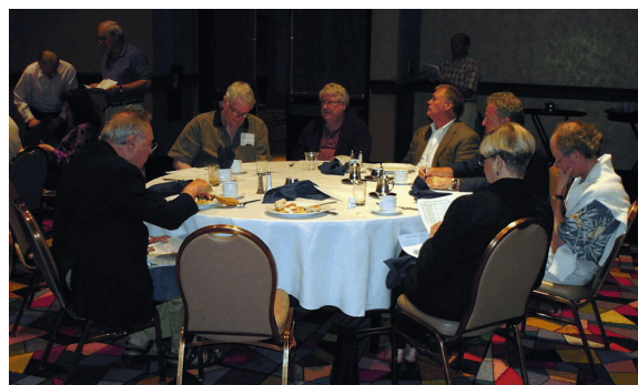
"Don't look up, he'll think you want to bid on those turkeys."