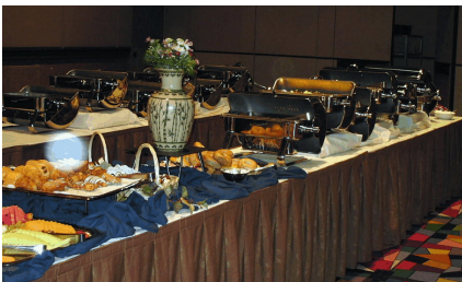
The WBP brunch buffet