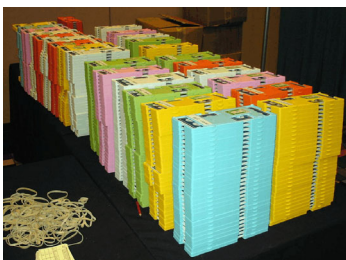
Tools of the trade

South leads the ♣9 pitching a heart from dummy, and North begins to feel the pressure. A diamond or a spade give up a trick immediately, so North must throw a heart. Now East plays another trump throwing another heart from dummy, and any pitch North makes is fatal.