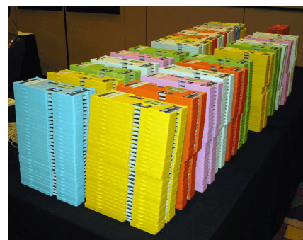
Weapons of mass destruction?