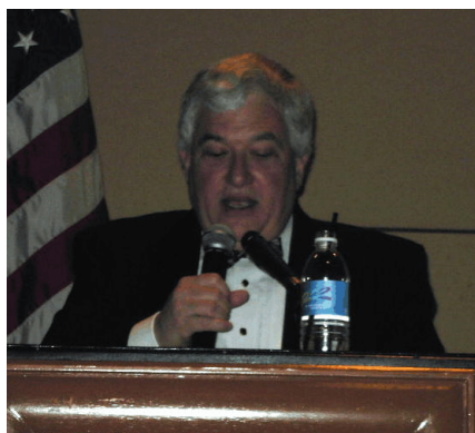
"Okay, who swiped my pants?"