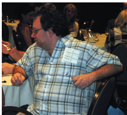
"And awa-a-ay, we go..."