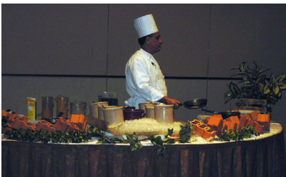
"Doesn't anyone around here want an omelette?"