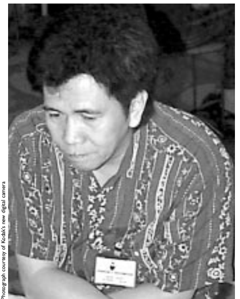
Photograph courtesy of Kodak's new digital camera

Indonesia had won the set by 44-25 IMPs and took a handy lead of 34 IMPs into the final 32 boards the next day.