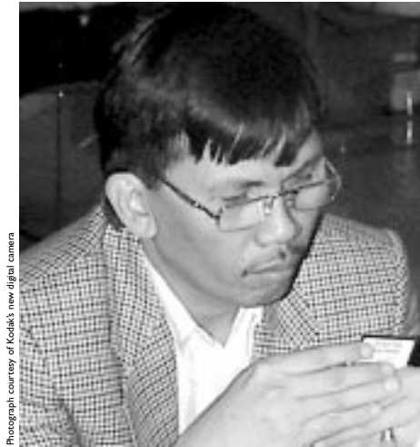
Photograph courtesy of Kodak's new digital camera