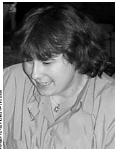
Photograph courtesy of Kodak's new digital camera

As you can see, North-South would have had no problem with the heart slam – with the cards lying as favorably as they do, they could even make seven, as indeed Denmark did in their match against Indonesia. The obvious three aces were taken against 6♣ – 500 to