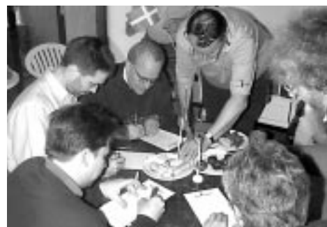
The Danish players discover that the match with Indonesia was tied, not won, as they compare scores.

The teams are extremely closely bunched, with more than a dozen teams right on the heels of the leaders.