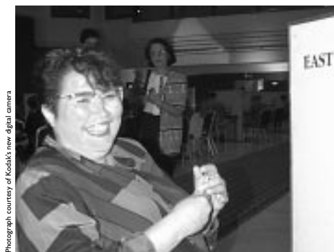
Photograph courtesy of Kodak's new digital camera