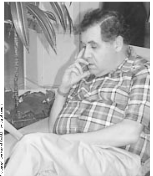
Photograph courtesy of Kodak's new digital camera

France had led by 27 IMPs going into Board 16. But US II scored 50 IMPs on the last five deals – and that includes a push on Board 18. Winning by 23 gave the Americans a crucial 20-10 victory.