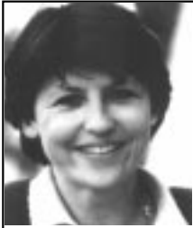
Martine Aubry Minister of Labour and Solidarity 1st Assistant of the Mayor of Lille