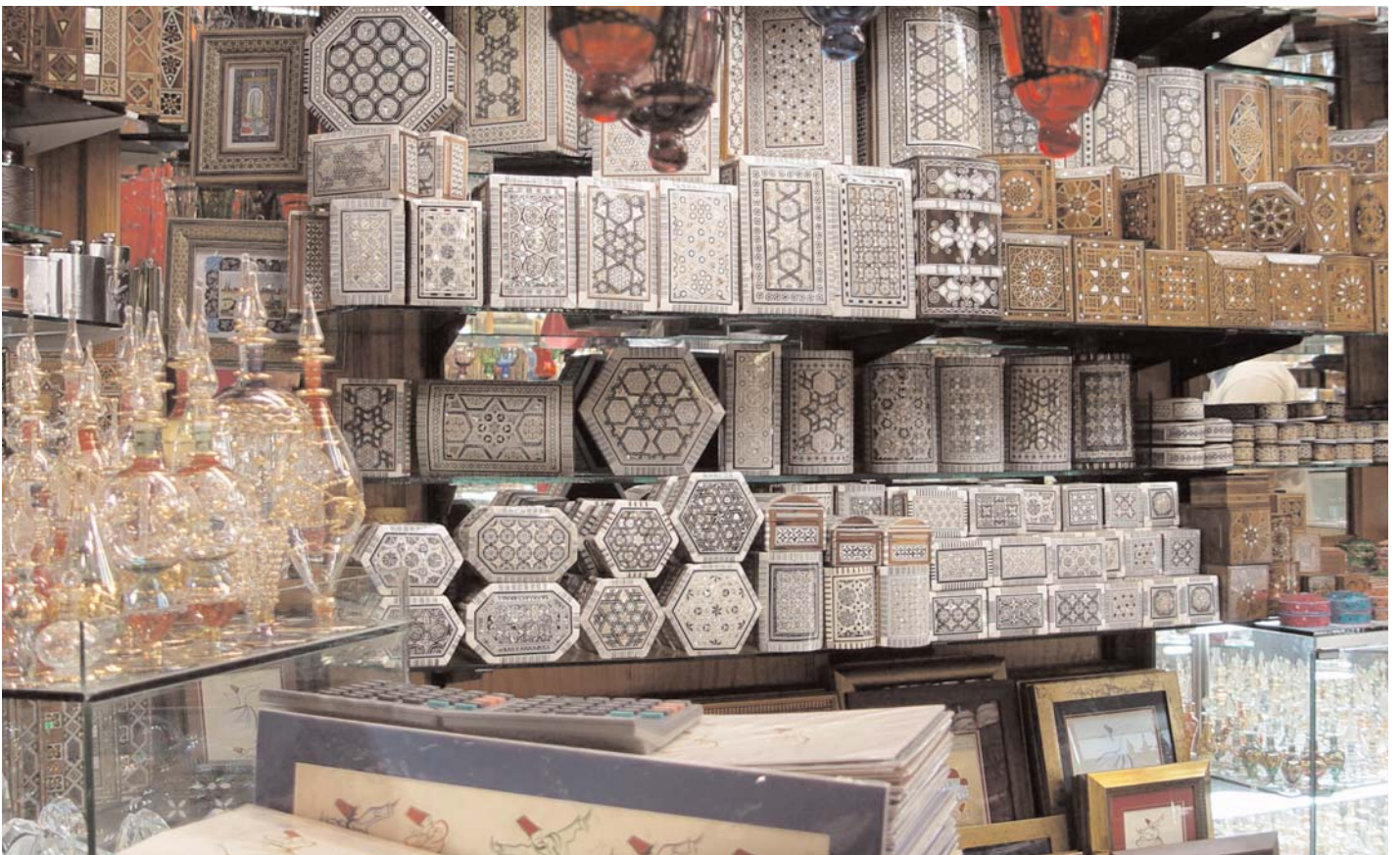
A vendor's stall at the Grand Bazaar, another of Istanbul's major attractions