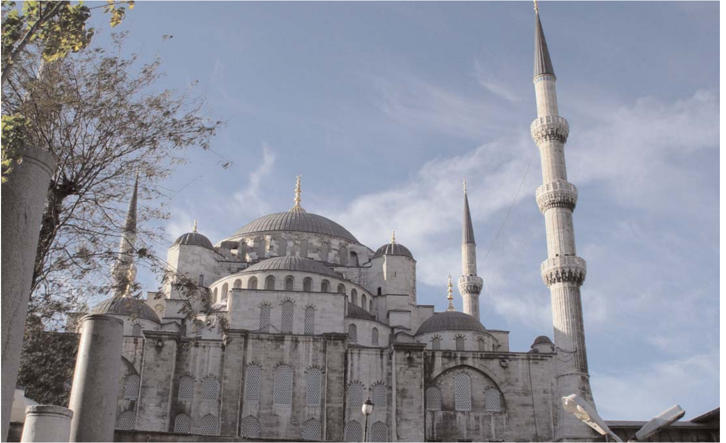
The Blue Mosque is one of the most popular tourist attractions in Istanbul