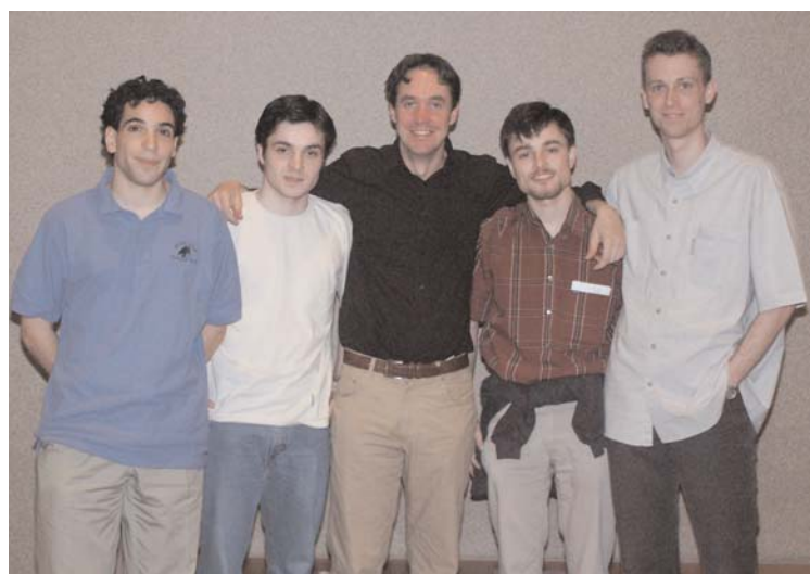
Silver medalists: Belgium