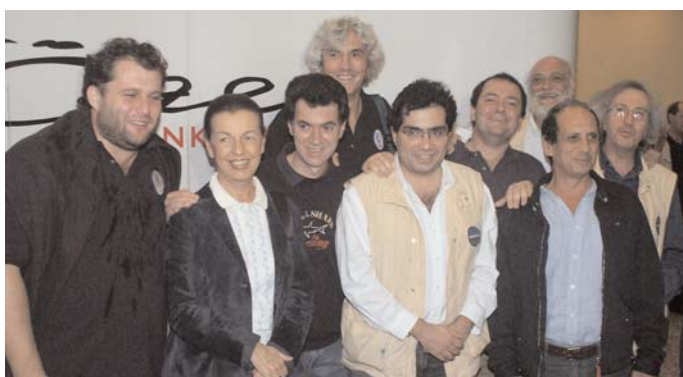
Italy: winners of the World Bridge Olympiad