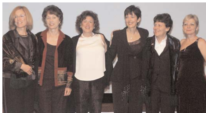
USA, the silver medal team in the Women's Olympiad.