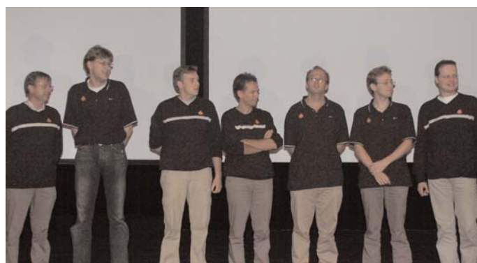
The Netherlands were second in the Olympiad

Four of the players who won the Open series of the World Bridge Olympiad for Italy have repeated as champions of the event with two new teammates. The Italians vanquished a young team from the Netherlands 310-251 to earn the title.