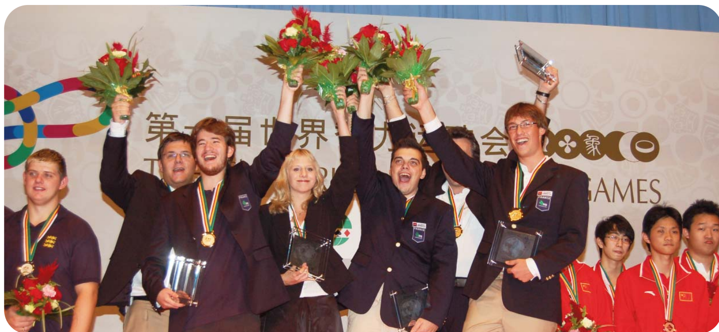
Happy winners: The French Champions of the U-21 Teams

It's the halfway point in the semi-finals of the Open, Women's and Seniors, and some teams have a lot of work to do to get to the gold-medal round.